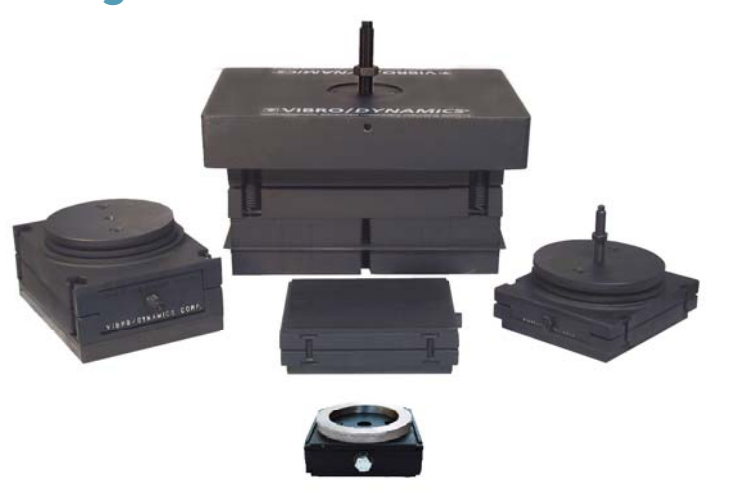
MX Modular Isolation Systems